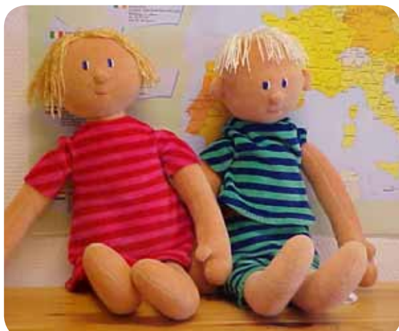
The two travelling dolls Johan and Maria (John and Mary)