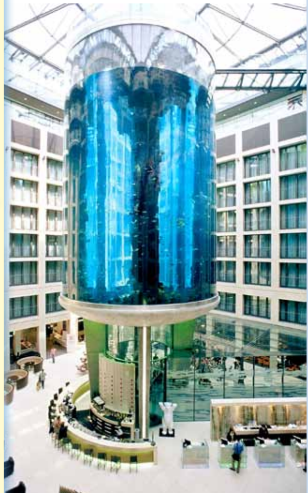
The AquaDom in the lobby of the Radisson Blu Hotel - the world's largest cylindrical aquarium, where a multitude of tropical fish reside in one million litres of salt water. The height of the AquaDom is 25 metres. A special feature is the two-story glass elevator inside the AquaDom.